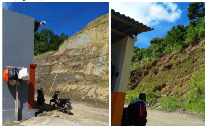
Figure 3. Ingramui village settlement adjacent to a steep hill without vegetation (left), a residential area adjacent to a steep hill with vegetation (right).

Table 3 shows that there are only two of the slope classes in the Wosi watershed, which is dominantly steep. The slopes have an influence on the velocity and the volume of surface runoff. Flat topography (0 – 8%) covering an area of 970.58 hectares (41.52%) has become an urban area of West Papua Province, including Wosi village, Bugis village, Javanese village, Makassar village, and Rendani. The flat topography of the lower and middle watersheds has become overcrowded into built-up areas and has begun to shift towards steeper slopes. According to Oktivina and Rudiarto (2019), the community began to change their behavior in land use in the suburbs from non-built land to built-up land. Furthermore, the steep slopes (25 – 40%) covering an area of 1,366.91 hectares (58.47%) of the Wosi watershed area include the villages of Udopi, Ingramui, and Soribo, with slopes ranging from flat to very steep at an altitude of 0 – 1450 m from sea level. The steeper the slope, the greater the runoff velocity if the area is less vegetation. Mahmud et al. (2021b) argue that land use for settlements/built-up areas has higher runoff and sediment than forest areas. The results of the survey of areas located on steep slopes that were previously plantations and forest areas began to be converted to settlements (Figure 3).