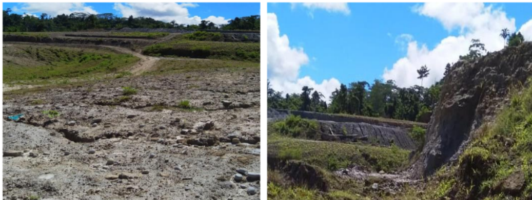
Figure 5. The planned upstream watershed for the built-up area has been partially leveled (left). Some of the lands is still steep and made like a ladder (right)

Along with the development of Manokwari City as the capital of West Papua Province, the area continues to experience forest land conversion. As Figure 5, the upper Wosi watershed has been cut off. Some areas are still shaped like a hill where landslides may occur. In fact, in 2012, some of the cities of Manokwari, which are adjacent to the watershed, experienced major floods. City development that does not follow the regency's spatial plan will cause not only a major flood but also landslides. The conversion 17 of land to built-up land is around 28.02 ha (39.5%), resulting in a decrease in groundwater, landslides, and an increase in surface water discharge (Dewi and Rudiarto, 2014).