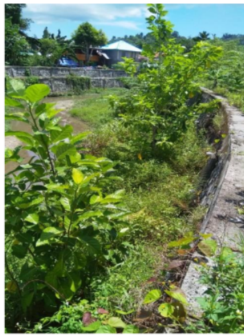
Figure 4. The flooded area where the embankment has been built

Kusumandari and Soedjoko (2006) discovered that topography is very influential on rainfall. If it rains on a steep surface without vegetation, a runoff will arise and flow downstream or to a lower place. Excessive flow cannot be accommodated by the river, causing flooding. In areas with a flat topography to slightly concave, water is easily concentrated and inundated, and if the amount of water is greater, then flood is inevitable (Marfai, 2011). One of the flooded locations has built an embankment (Figure 4), but the embankment is not fully able to cope with flooding. Many embankments were built in flooded areas, but because the upstream watershed had a lot of land conversion, water with great speed was able to destroy the embankment, eventually, it broke, and the flood reoccurred.