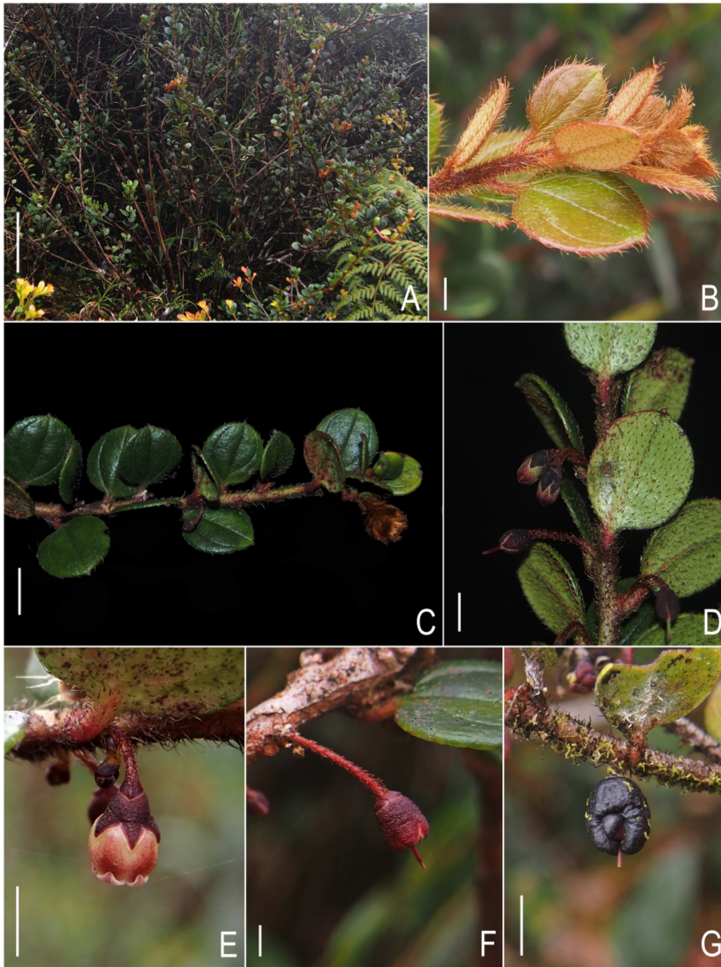
FIGURE 1. Diplycosia puradyatmikai . A. Living plant. B. Young leaves and buds with long golden brown bristles. C. Leafy twig. D. Leafy twig showing lower leaf surfaces and some flowers. E. Flower. F. Young fruit. G. Older fruit. Scale bar: A = 20 cm; B, C = 2 cm; D, E = 5 mm; F = 2 mm; G = 5 mm. A–F from Mustaqim et al. 2234 and G from Mustaqim et al. 2236.