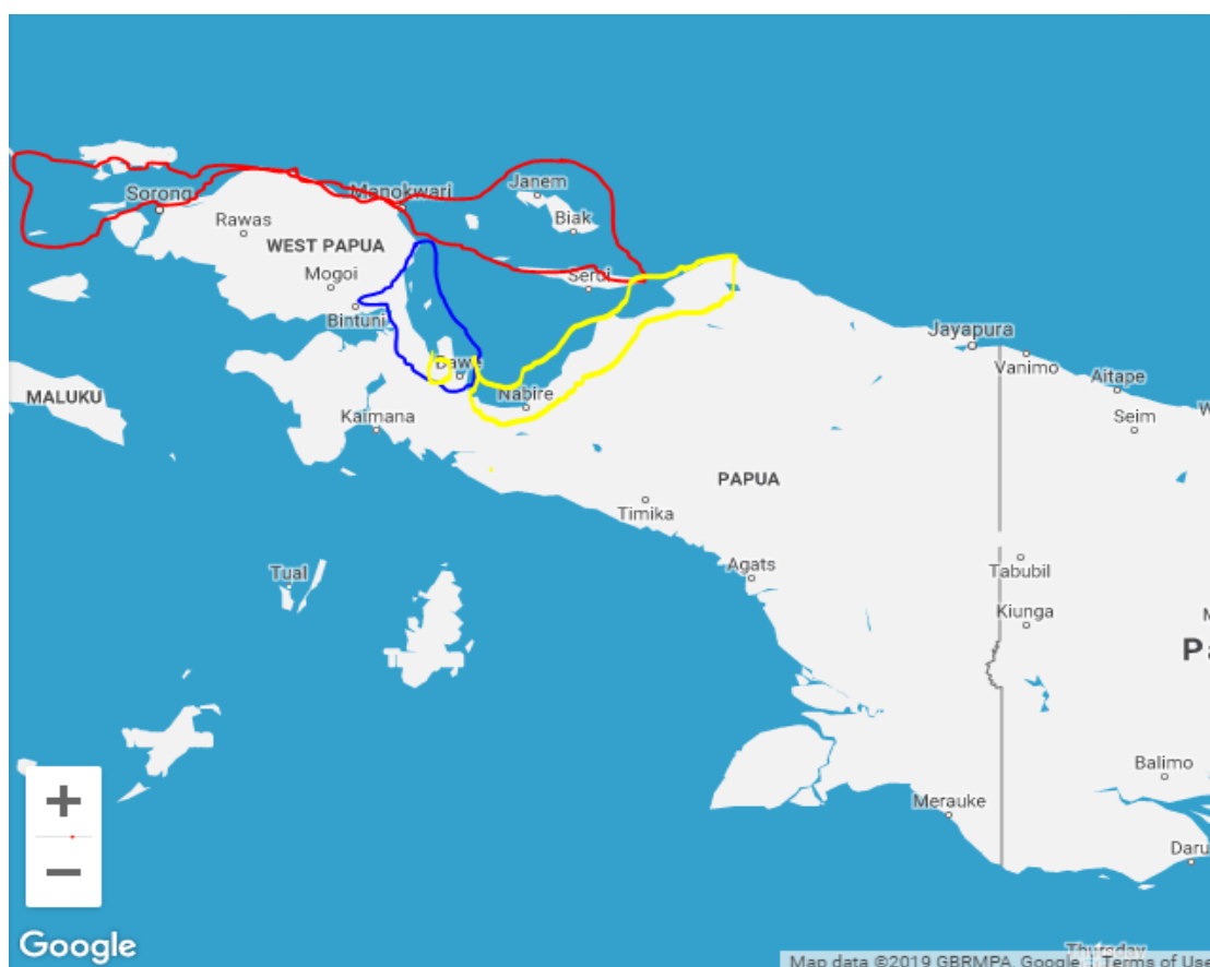
Map 3: The spreading areas of Biak (red line), Wandamen (blue line), and Waropen (yellow line) languages used as lingua franca.