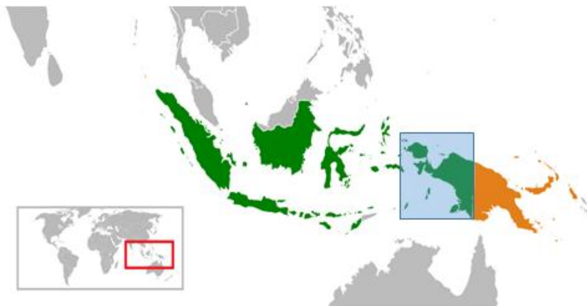
Map 1: Islands of Indonesia figuring the Papua region

The Papua region (Western Half of New Guinea) is one of the most linguistically diverse region in the world. There are about three hundreds distinct languages and/or dialects spoken by mostly small speech communities in this region. Each speech community may speak a language or dialect that is totally different from its neighbouring speech communities. Although, the number of languages spoken in this region is so high, most languages have fewer than 1,000 speakers. Even, many of them have fewer than 100, some even fewer than 50 speakers (Foley, 2000).