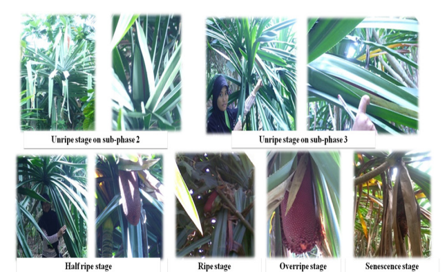
Figure 1. The development of maturity stages of red fruit (Santoso et al. 2011)