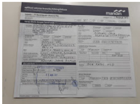
Bank transfer receipt_Bioflux (Large).jpg 347K