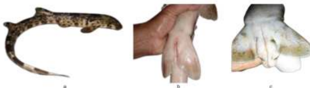
Figure 3. (a) Hemiscyllium galei ; (b) Female specimen showing vent; (c) Male specimen showing claspers.

Oceanographic conditions recorded in each sites shows values as follows. Water temperature of 28.03-30.06 °C, water transparency of 12-14 m, current speed of 0.4-0.7 ms -1 , Salinity of 33-36 ‰, pH of 7.0-7.6 and dissolved oxygen of 6.3-7.0 mgL -1 . Referring to the environmental quality standard reference issued by the Indonesian