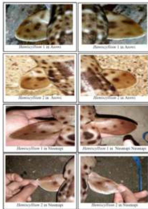
Figure 2. Examples of spot shapes on the pectorals of some walking shark.