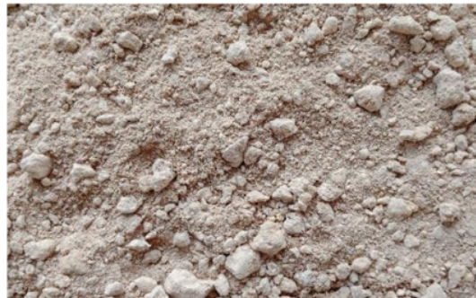
Figure 4. Starch characteristics of sago palm in both TIA and WIA types

Color of starch powder produced by palms of both locations showed no differences between them. The color of starch of both TIA and WIA types was yellowish white (RGB158C or hexRGB: fbe5cb) (Figure 4). The starch color of sago palms of TIA and WIA types is slightly different from starch color that was reported by earlier researchers. Dewi et al. (2016) reported the characteristics of starch color of sago palm in the South Saifi Sorong district was influenced by bark color that was Pink (5YR8/3). The quality of sago starch is influenced by genetic factors and extraction processes, such as water used and filtering (Flach 1997). According to Purwani et al. (2006), the degree of whiteness of sago starch varies and can turn brown or reddish during storage. This color change is due to the activity of the enzyme Latent Polyphenol Oxidase (LPPO) that catalyzes the oxidation reaction of polyphenol compounds to quinones which then form polymers and produce brown color (Onsa et al. 2000). According to Haryadi (2002), white starch of sago palm can be obtained by spraying water at the time of mixing.