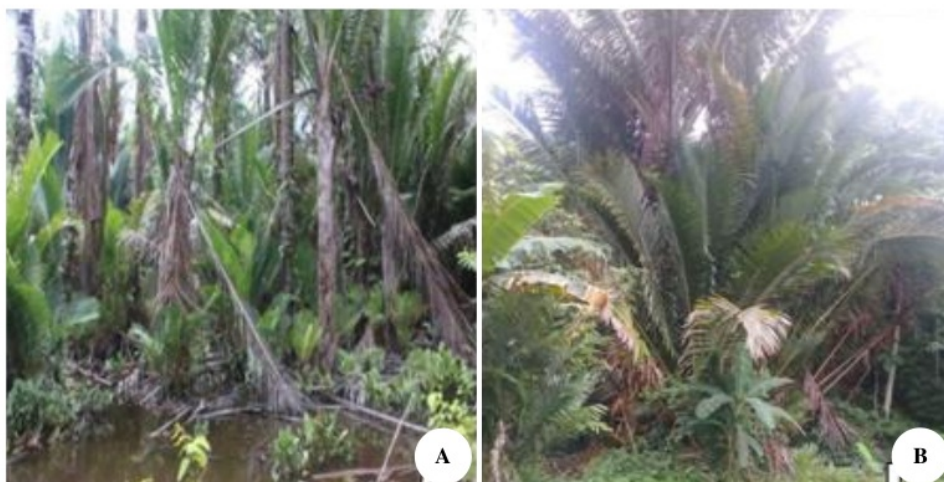
Figure 1. Sago palms used as samples. A. Temporarily inundated areas (TIA), B. Areas without inundation (WIA)