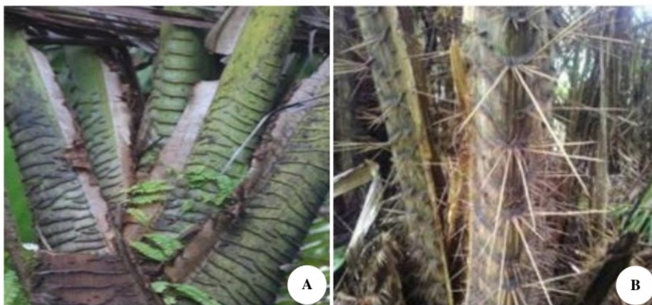
Figure 2. Appearance of spines on the surface of petiole. A. Spineless petiole in the trunk stage; B. Plenty of spines on petiole in rosette stages