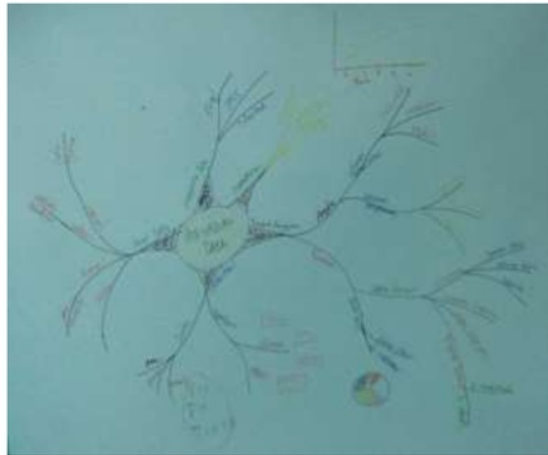
Figure 1. Lesson Design