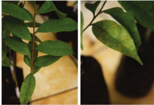
Fig. 1. The leaf morphology of A. microcarpa after four days inoculated by Fusarium #512

The genotype of every seedling (Table 3) was