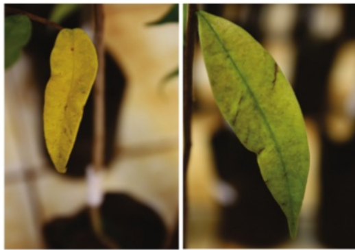
Fig. 2. The leaf morphology of A. microcarpa after 8 days inoculated by Fusarium #512

based on the locus 6PA18 and 71Pa17. The measurement result of detected length fragments, where locus 6PA18 has 10 genotypic variation such as 184/184, 184/198, 198/198, 198/210, 210/210, 198/198, 198/210, 198/222, 210/210, 210/222, while locus 71PA17 has 8 genotypic variation including 158/158, 166/166, 166/178, 178/178, 178/198, 194/195, 194/198