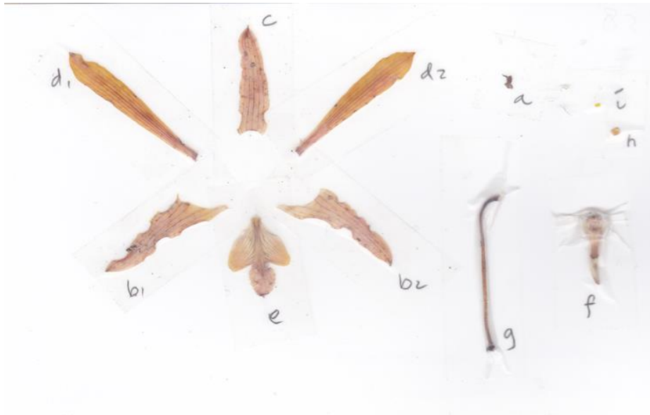
Figure 1 A pressed-floral dissection cards from Dendrobium devosianum J.J. Smith collected from the field (a. bract; b. lateral sepals; c. dorsal sepal; d. petals; e. labellum; f. gynostemium; g. pedicel; h. pollen cap; i. pollinia) (Collected and pressed by AYSA).