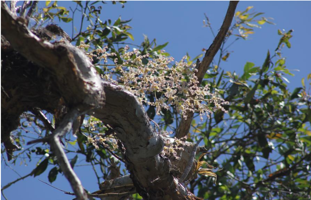
Figure 3 Example of the host tree of Melaleuca cajuputih where Dendrobium discolor hosted.

As can be seen from datasets in Table 1, the most common host trees for the orchids belongs to family Myrtaceae . Data indicates the genus Melaleuca is the preferable host tree and profitable habitat for these orchids group. The bark of this genus offers best positioned-media for a dust-like seed of orchids nesting to the stem. This family is an indicator of the vegetation type of heath forests that can only be found in the southern part of New Guinea Island. Other genera of host trees recorded from family Proteaceae is Acacia and Banksia . They are the common genera associated with Melaleuca in the heath forest vegetation. These last two genera were spotted at one study site in Sota district.