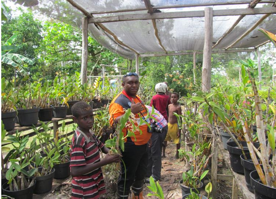
Figure 4 Orchid’s nursery runs by locals who inhabit the national park.