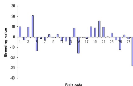
Figure 2 Breeding value of yearling weight.